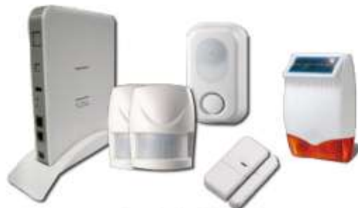
Copyright © 2010 Everspring Industry Co., Ltd.